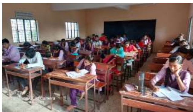
College students participated in Essay writing competition