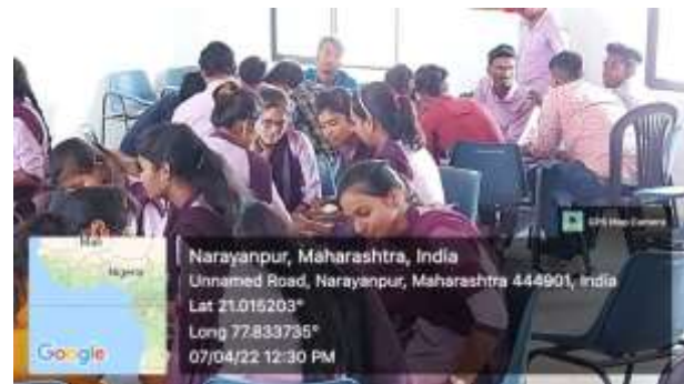
Students discussing on subject Health and Hygiene.