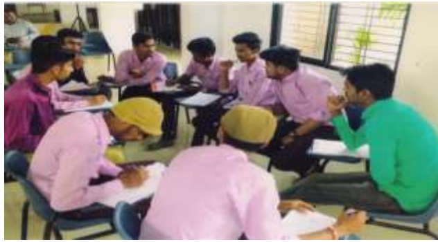
Students Discussing on given subject in programme