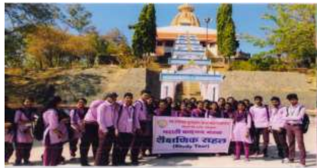
Study tour organized by department of Marathi to visit Rashtrasant Tukdoji Maharaj Gurukul Mozari Ashram.