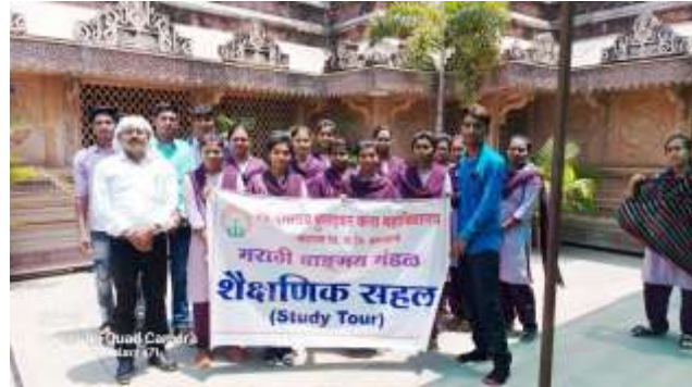
Study tour organized by Marathi Literature Department visit at Ambadevi Temple Amravati.