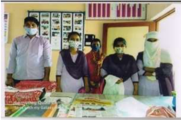
Discussion with students to resolve their study grievances in Marathi department