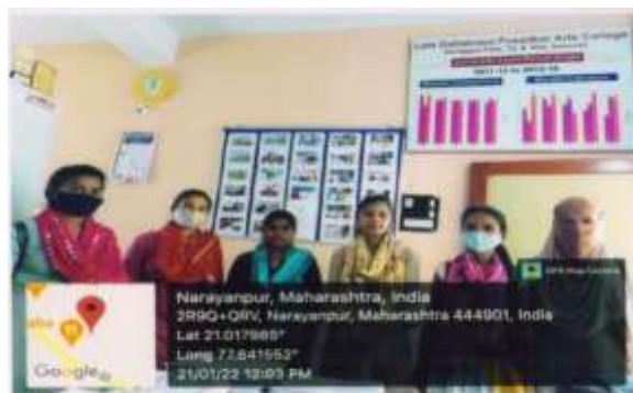
Discussion with students to resolve their study grievances in Marathi department